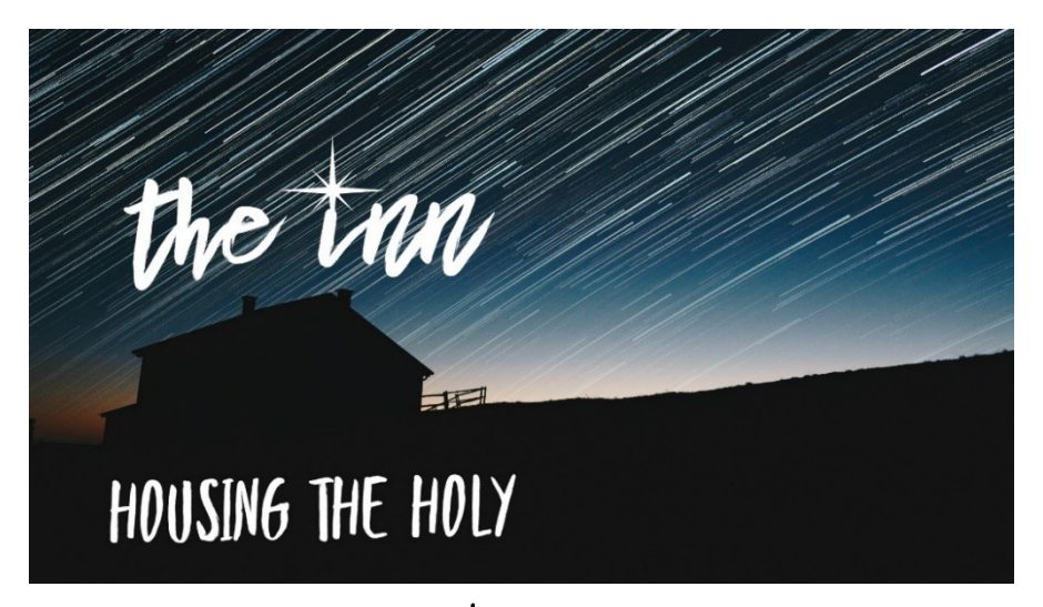
A PLACE AT THE TABLE OF PEACE

As we enter the Advent season, how can our churches become houses where the Holy will be born anew—offering respite, sustenance and care, opening the doors ever wider to those seeking shelter from the onslaught of life? No one church can do it all, but each can do something. As we study the biblical prophets that call us to care for our neighbors and "make room in the inn," the lonely and frightened spaces within us are filled with the light of Hope, Peace, Joy, and Love.