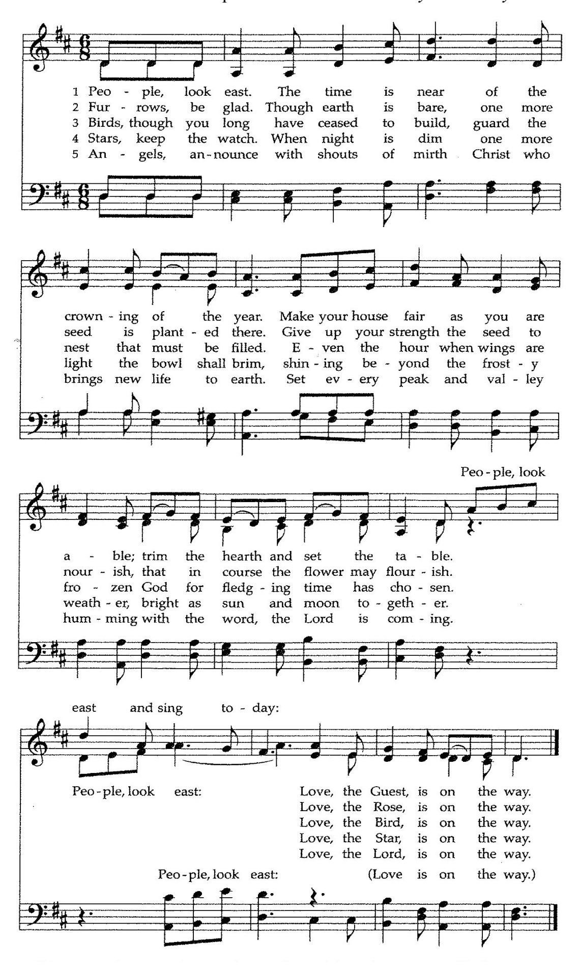
*GATHERING HYMN "People Look East" #105 Glory to God Hymnal