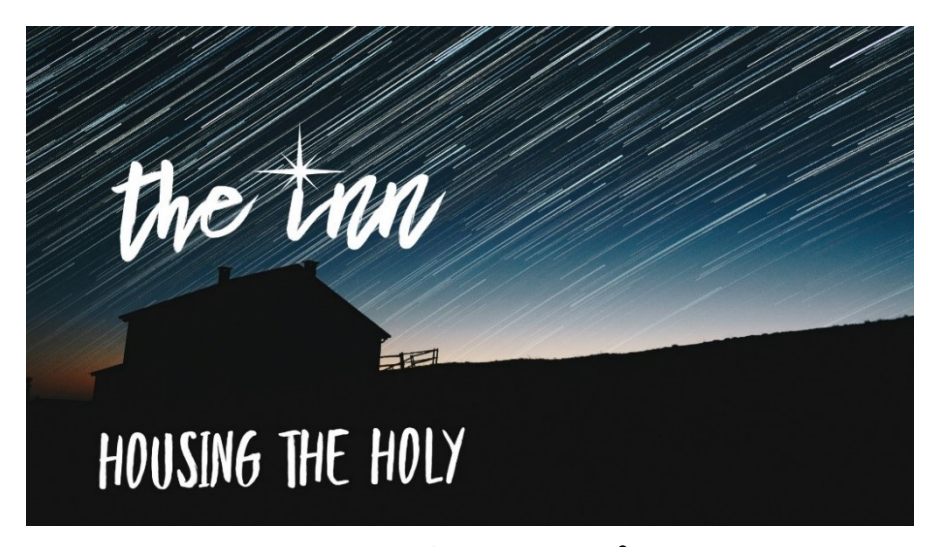
A Room with a View of Love

In this Advent season, how can our churches become houses where the Holy will be born anew-offering respite, sustenance and care, opening the doors ever wider to those seeking shelter from the onslaught of life? No one church can do it all, but each can do something. As we study the biblical prophets that call us to care for our neighbors and "make room in the inn," the lonely and frightened spaces within us are filled with the light of Hope, Peace, Joy, and Love.