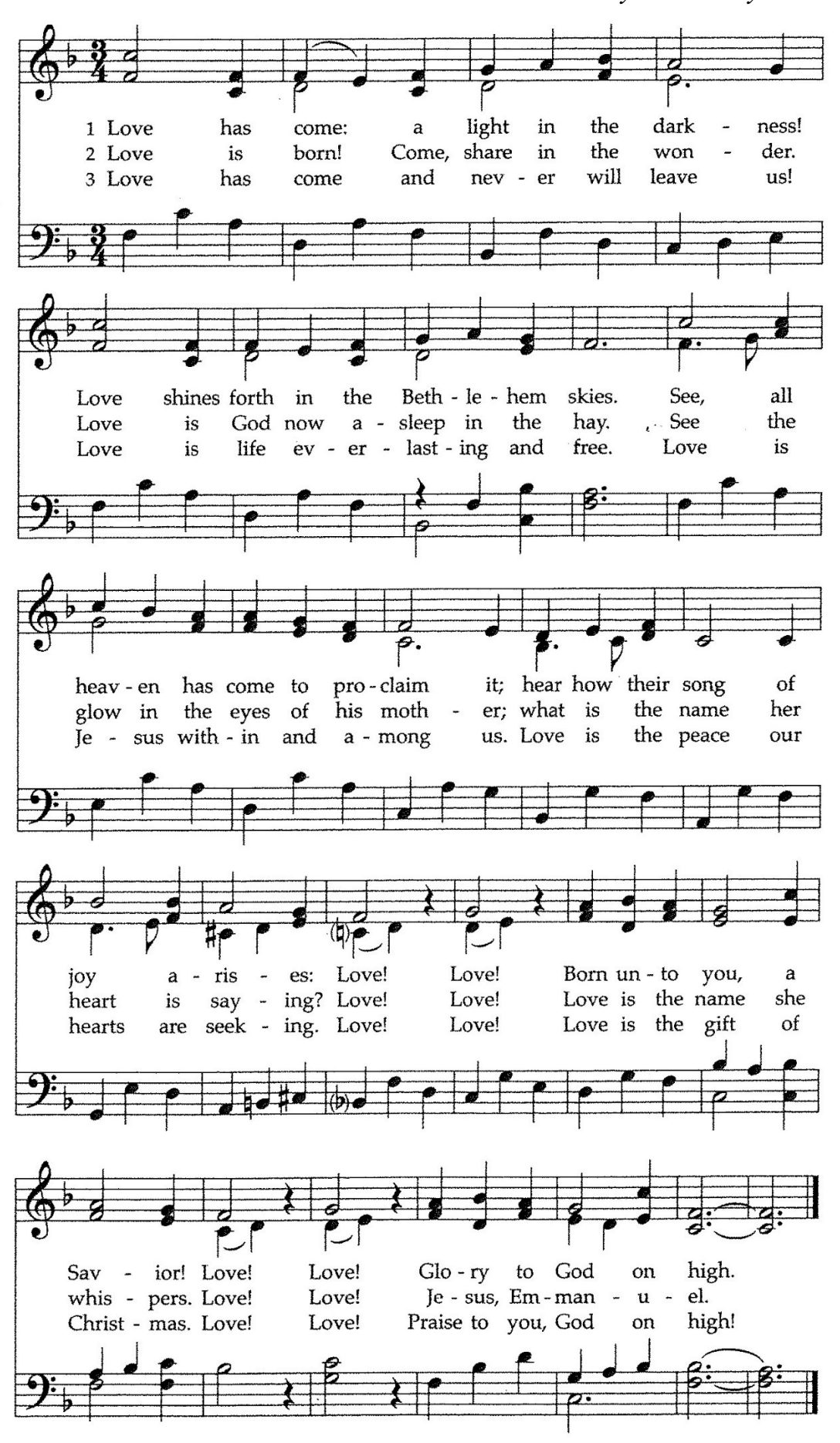
*CONGREGATIONAL CAROL "Love Has Come" #110 Glory to God Hymnal